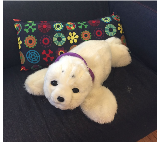
Figure 1: Paro: a socially assistive, seal-like robot.

to amend. Additionally, we gauged people's perceptions of having data about their interactions collected via sensors onboard the robot and made available to them and others (e.g., therapists, family) as an additional intervention mechanism and explored the potential use of such sensors in the course of depression care and therapy.