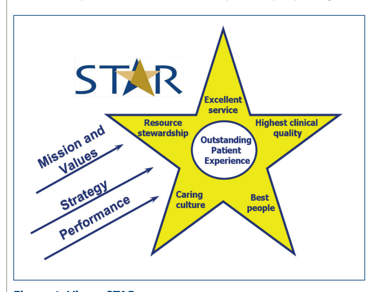
Figure 1: Virtua STAR

nized the need for a culture of accountability to improve performance and the importance of investment in the talent of people. After conducting research and exploring several options, senior leadership decided to adopt an integrated leadership and talent management system and an accompanying set of practices and tools. Known as Virtua's Leadership and Management System , this system seeks to ensure that each patient's experience is outstanding by focusing on five strategic organizational imperatives (known as "STAR" points): service excellence, a caring culture, best people, clinical quality and patient safety, and resource stewardship. Of the five imperatives, the most important to senior leadership is best people (Figure 1).