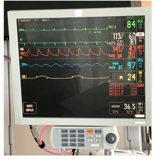
Fig. 1 A photo of a bedside patient monitor in use at a medical surgical intensive care unit of the UCSF Medical Center. The salient features of the display include: (1) 6s of multiple channel physiologic signals; (2) vital signs and their upper and lower threshold for alarming; (3) text of last four alarms. In addition, a panel of multiple buttons to access all monitor features and configurations is attached. The look-and-feel of this display has largely remained unchanged for decades as well as core ECG signal processing and arrhythmia detection algorithms

scope has been expanded beyond analyzing just alarms as will be discussed in this perspective. Realizing that innovating core algorithms for patient monitoring is challenging and can be better aided by a roadmap, we hence synthesize our previous work into a four-element algorithm strategy under which future innovations can be conceived and pursued in a more systematical way towards achieving precise patient monitoring.